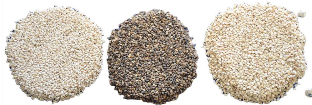
seed colour type